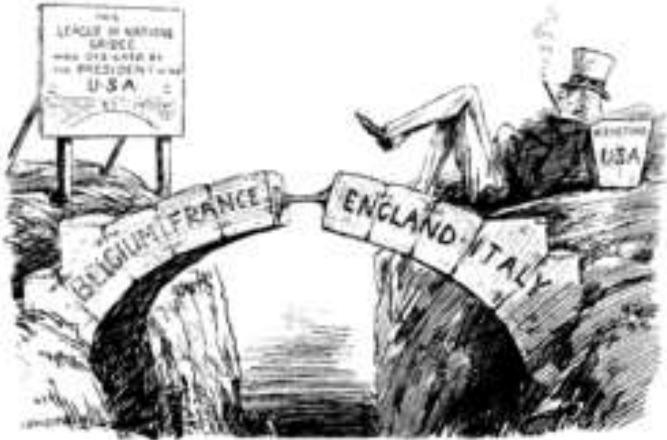
THE GAP IS THE BRIDGE.

7) An organization created after World War One to maintain world peace but without US support and weak efforts from England and France it failed to protect countries from Nazi Germany, Italy, and Imperial Japan